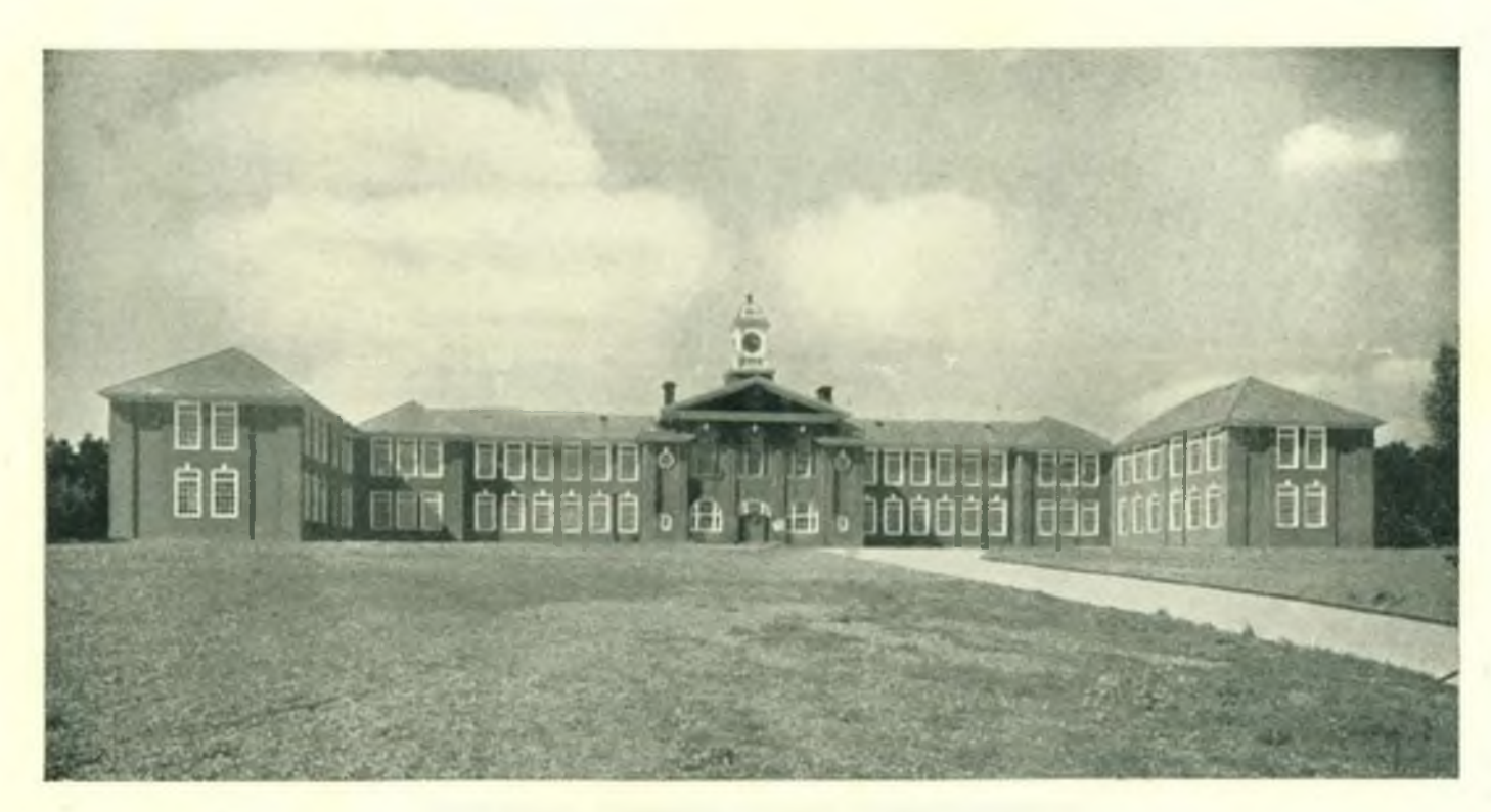
THE ROYAL GRAMMAR SCHOOL, HIGH WYCOMBE